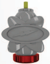
14-16 lb. Core