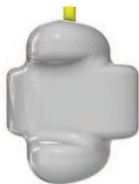
12, 13 lb. Core